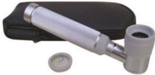
GM Dermatoscope (German Technology) Supply: with soft pouch Require: 2X C size batteries