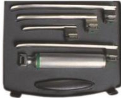
Fiber Optic Miller set