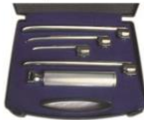
Fiber Optic Miller set

Supply in hard case Require 2X C Batteries